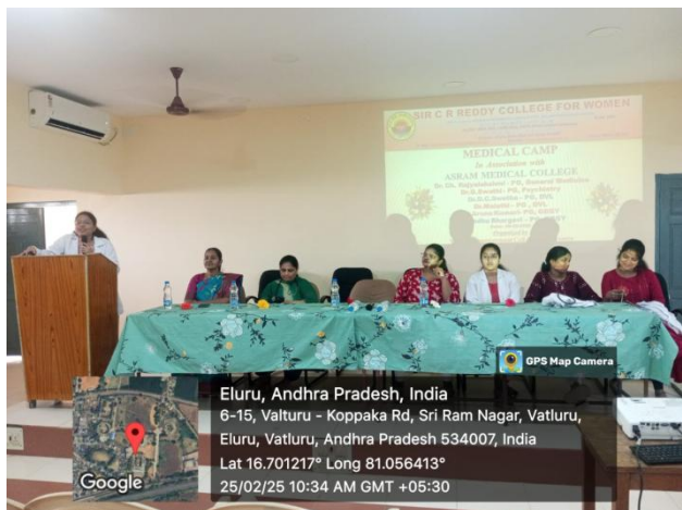
Doctors Self introduction

All the students were attended the medical camp and benefitted. The medical team also arranged for free Blood Sugar Level and Blood Pressure tests which were hugely useful for many students. Nearly 400 students have undergone their general health check-ups, many students were benefitted with the medicines provided with free of cost. Few of the students were referred by the doctors for further treatment at ASRAM Hospital. Volunteers have played a vital role in making this camp success with their dedication in serving people they directed everyone in all needy way.