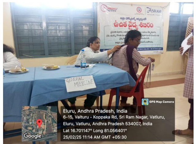
Doctors are checking Students health