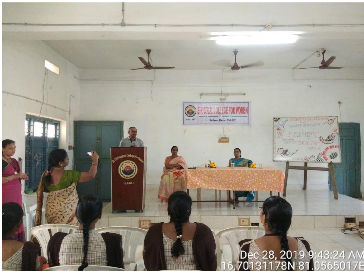
III BSc Chemistry cluster students attending the interactive session