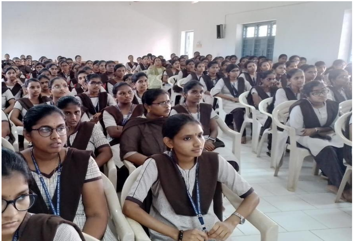
All 1 st year students & lecturers for B.Sc and B.Com are attended for the program