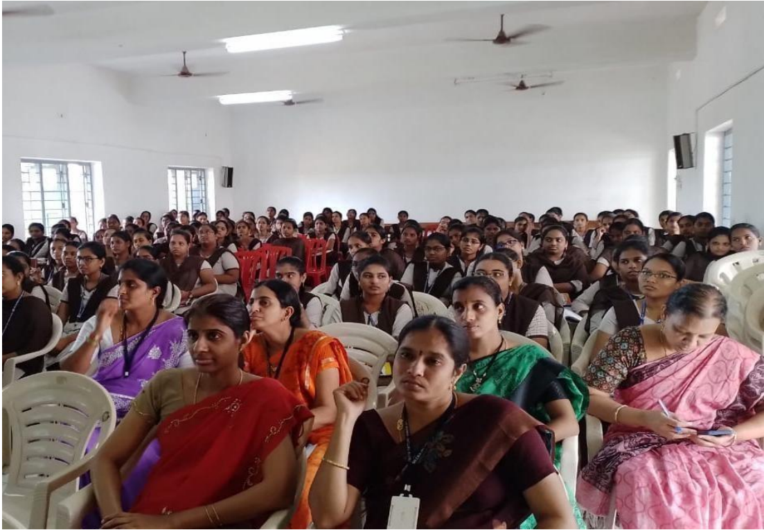
All 1 st year students & lecturers for B.Sc and B.Com are attended for the program