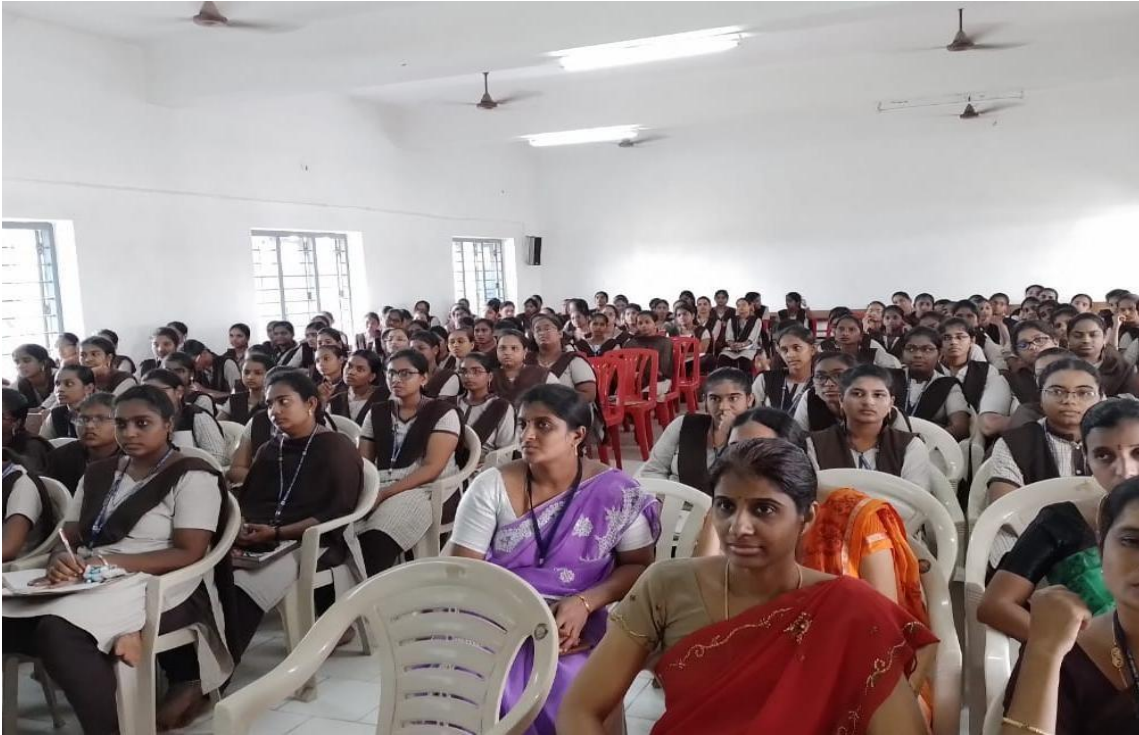
All the first year B.Sc and B.Com students are actively participated in the orientation program