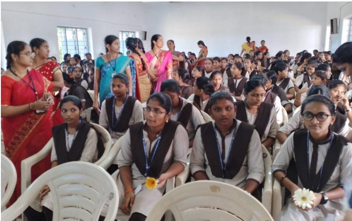
Students felt that orientation program ensures a smooth communication between themselves