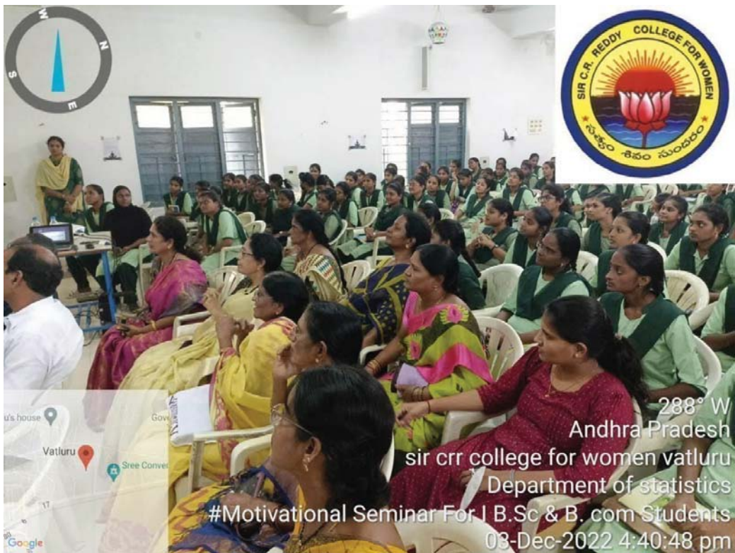
All 1st Year students & lectures for B.Sc and B.Com are attended for the seminar.