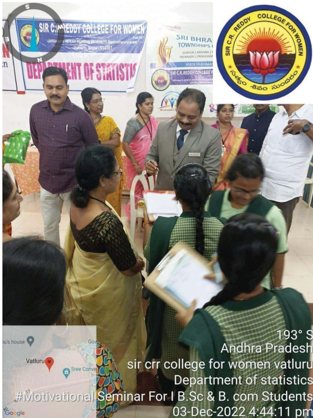
Students show more excitement for this motivational session.