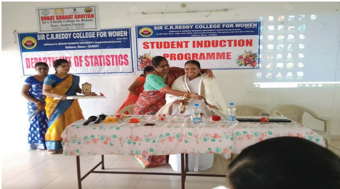
Felicitation by principal madam