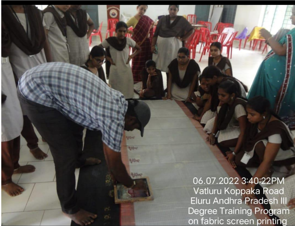
06.07.2022 3:40:22PM Vatluru Koppaka Road Eluru Andhra Pradesh III Degree Training Program on fabric screen printing