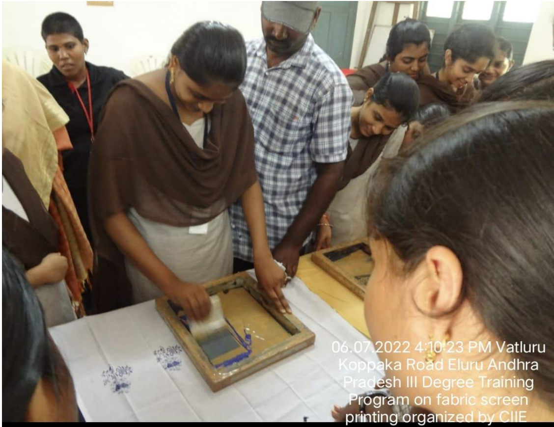
06.07.2022 4:10:23 PM Vatluru Koppaka Road Eluru Andhra Pradesh III Degree Training Program on fabric screen printing organized by CIIE