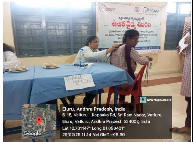
Doctors are checking Students health