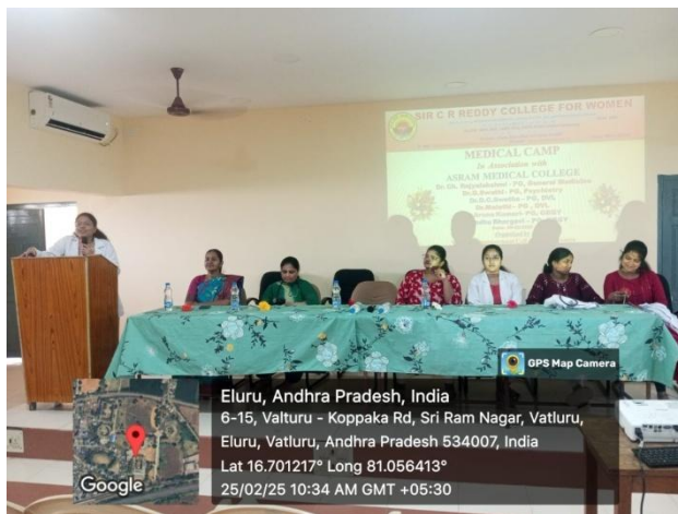
Doctors Self introduction

All the students were attended the medical camp and benefitted. The medical team also arranged for free Blood Sugar Level and Blood Pressure tests which were hugely useful for many students. Nearly 400 students have undergone their general health check-ups, many students were benefitted with the medicines provided with free of cost. Few of the students were referred by the doctors for further treatment at ASRAM Hospital. Volunteers have played a vital role in making this camp success with their dedication in serving people they directed everyone in all needy way.