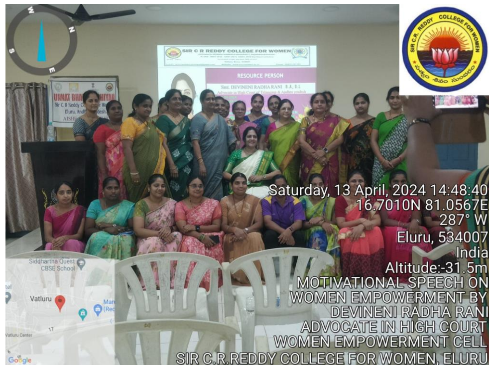
Old Students interacting with Devineni Radha Rani