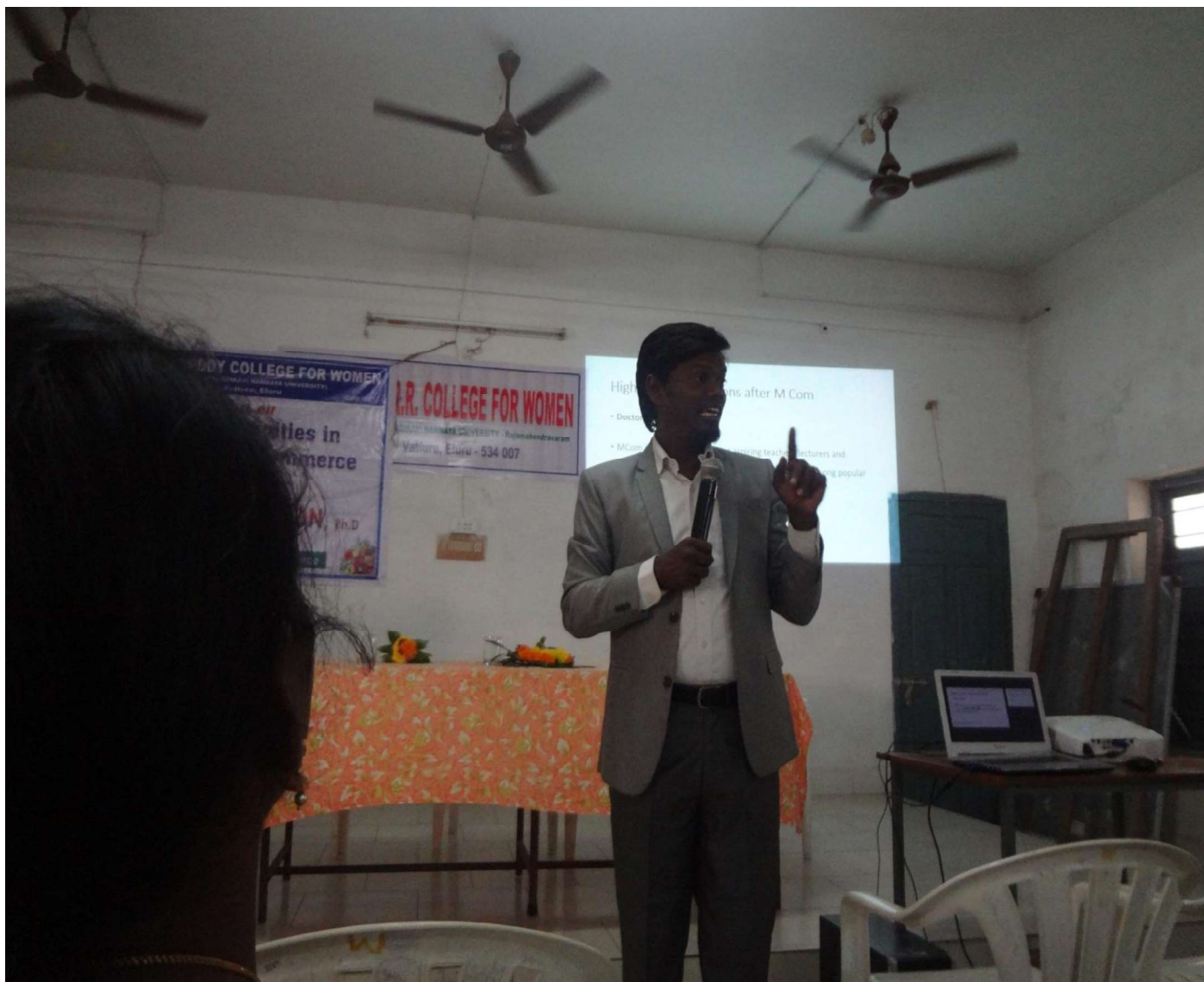
Speech to the students for the career opportunities