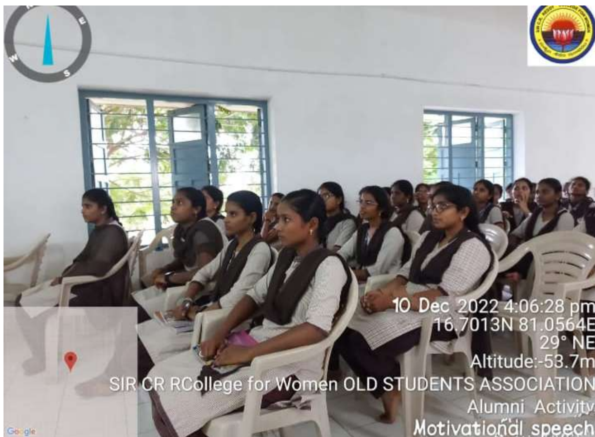
III BSc Chemistry students of Sir CRR college for women, attended the session