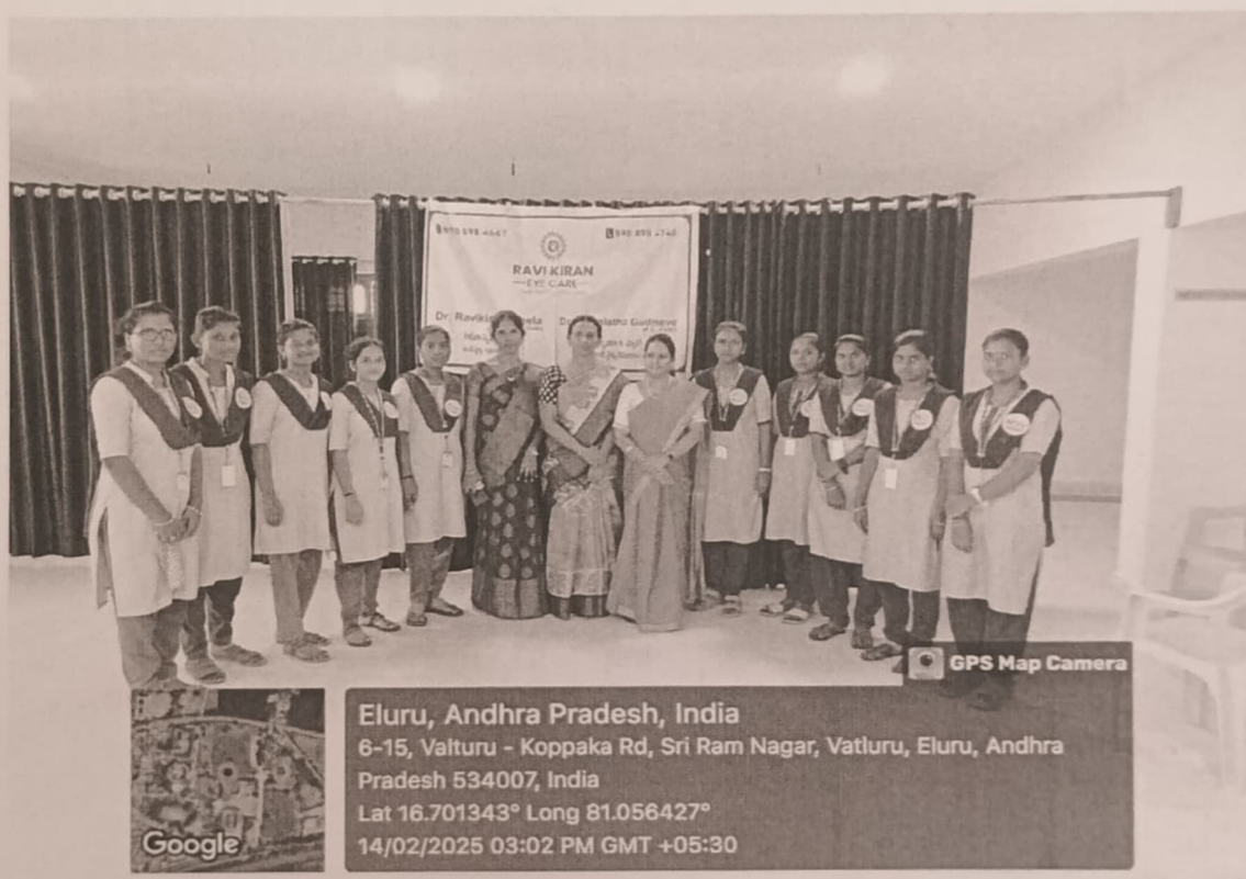
Staff, NSS volunteers, students participated in the program.