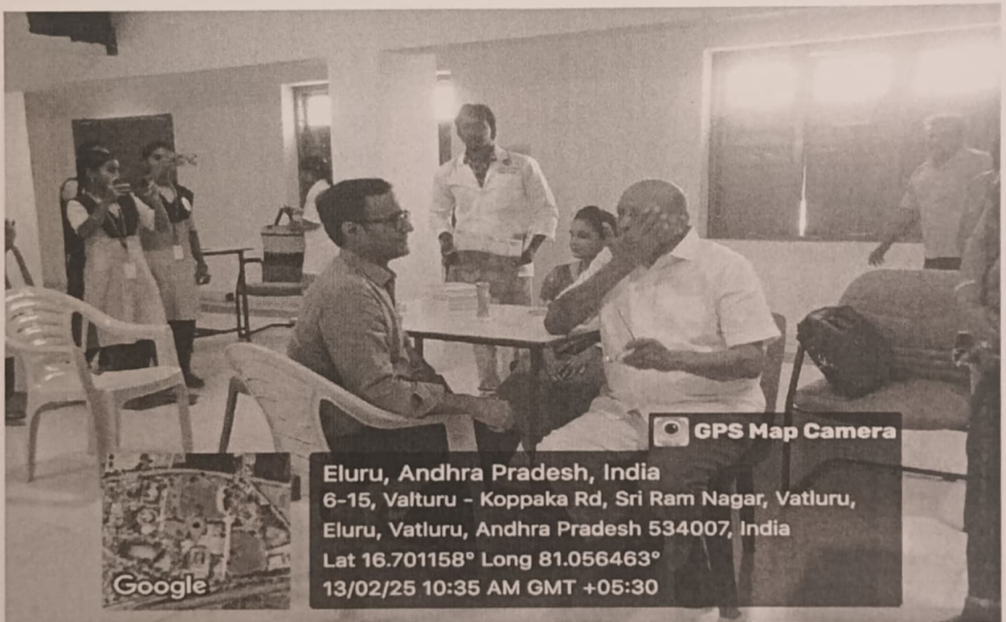
A Doctor examining a patient